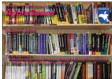
Cover picture: Looking for answers? Lots here. (The Macintosh shelves at Dymocks)