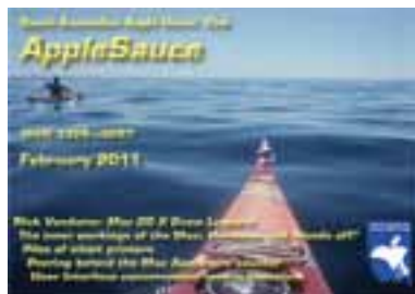
Cover picture: Somewhere between Edithburgh and Glenelg on 3 February 1981 during the final leg of the first kayak crossing from Pt Lincoln to Adelaide. Mt Lofty is faintly visible in the background.