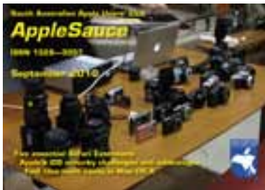
Cover picture: Some of the photographic equipment on display at the August meeting.